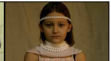
Exhibition of children's self-portraits inspired by the works of Gartner: a follow-up to the dance workshops.