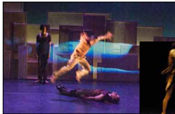
Enfin vous zestes in performance

From 2008 to 2010, this is the work we've accomplished with Enfin vous zestes , Louise Bédard Danse's most recent creation. Thanks to our generous donors, we were able to dive deeper into our art and broaden the scope of our creative efforts. Dance performances of the highest quality have been the result. Surpassing our limits and renewing our commitment to innovation is always foremost in our intentions. Financial support provided by our supporters has allowed us to remain close to our audiences and fulfil the entire spectrum of our artistic, social, and educational mandate.