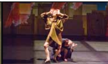
Enfin vous zestes , created at Usine C in September 2008 : « a visual masterpiece » according to Straith.com.