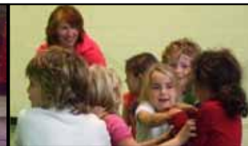
Dance workshops in various schools : introducing kids to dance and preparing them to attend the performance.